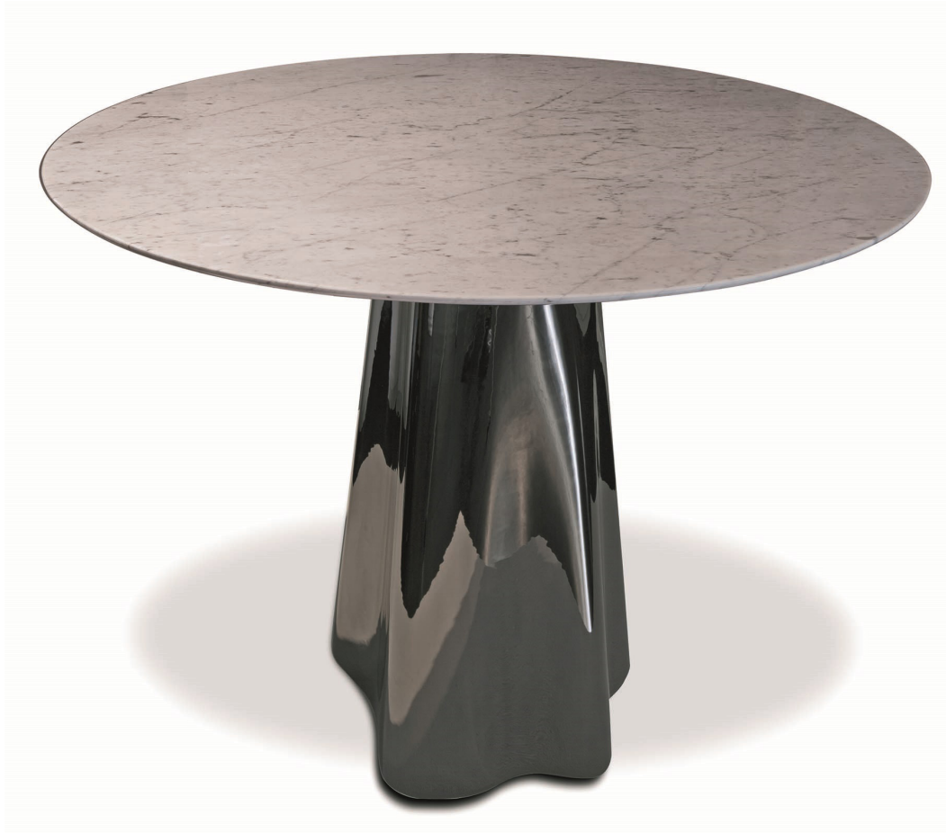
Table Diameter 100 × 74H cm

Designer: Damien Langlois-Meurinne Collection I