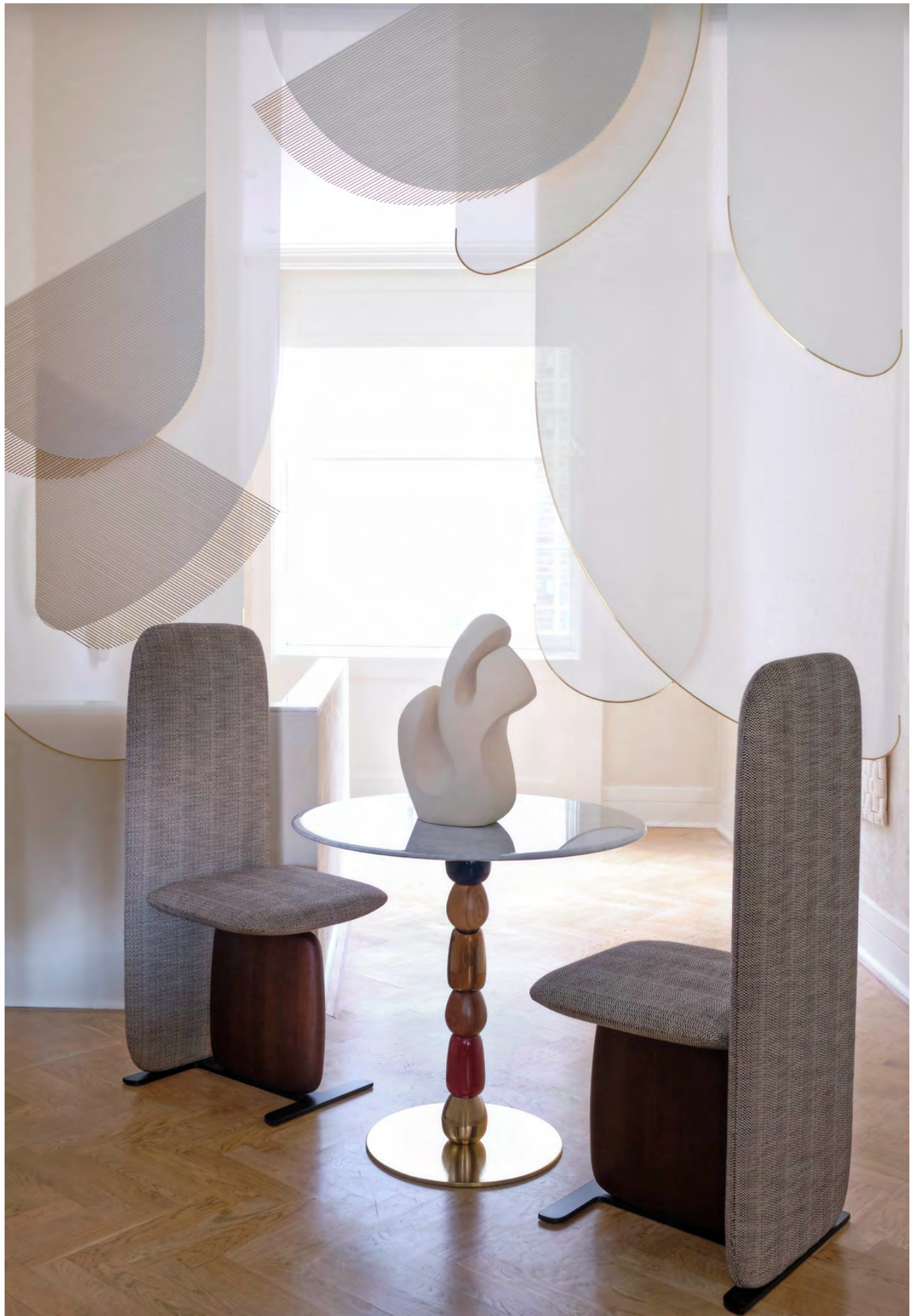
www.se-collections.com Gaea Bistro Table, Atlas Dining Chairs & Architectural Window Panels by Studio MTX