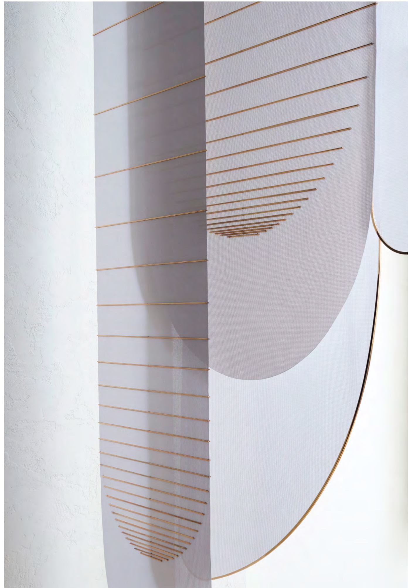
www.se-collections.com Architectural Window Panels by Studio MTX